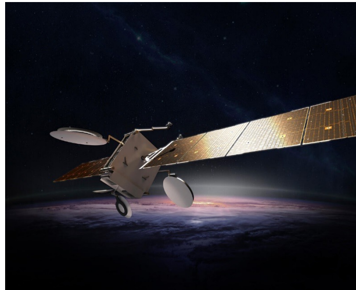
Artist rendering of Boeing's 702X satellite

The 702X incorporates proven design and technology from programs such as SES Networks' O3b mPOWER satellite, which is the medium Earth orbit variant of the 702X. The payload is flexible, configurable and has the lowest cost-per-bit offering in its market class. Applicable to any orbit, the 702X will change how operators use satellite communications to deliver value to end-users. With thousands of beams that are formed in real time and can be pointed and shaped where needed, 702X allows operators the flexibility to point power and bandwidth among users, maximizing useable capacity and eliminating wasted energy.