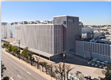
Exterior of Boeing Satellite Factory

Boeing's satellite systems business is located in El Segundo, Calif. The world's first geosynchronous communications satellite, Syncom, was built there by Boeing and launched in 1963. Since then, Boeing has delivered more than 300 satellites to more than 50 customers in more than 20 countries, and continues to design and build government and commercial satellites in its factory in El Segundo.