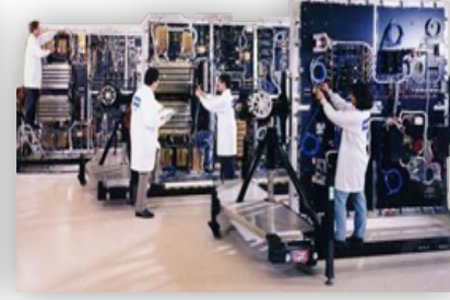
Payload Integration & Test