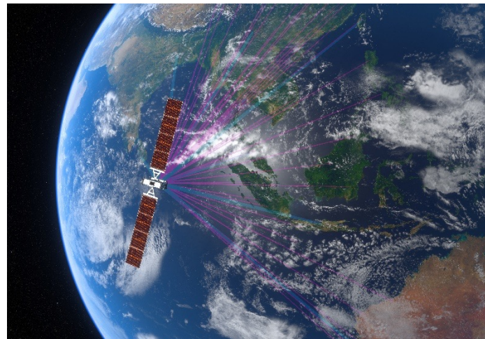
Artist rendering of the flexible, steerable beams of Boeing's 702X satellite for SES's O3b constellation