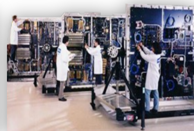
Payload Integration & Test