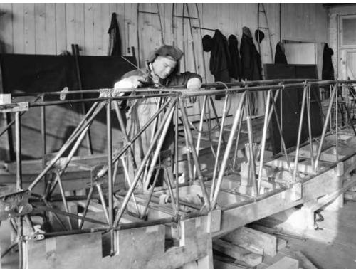
MAN OF STEEL

Working on a DH-4M fuselage wing frame, March 1923.